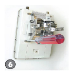
Step 3: Mount the WAB-7400 equipped with the holder on the pole shown as 7~9.