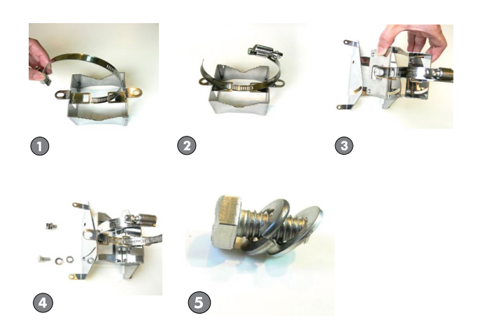
Step 2: Equip the metal plate on the bottom case of WAB-7400 shown as 6.