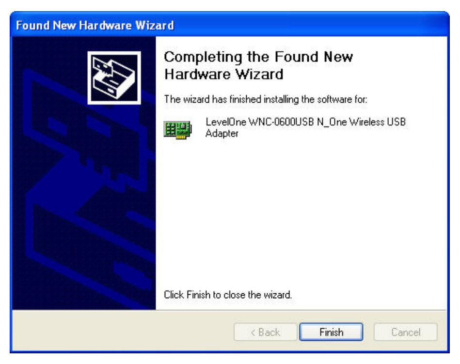
Figure: Complete the Found New Hardware Wizard

13. When the Wizard has finished installing the software, click "Finish".