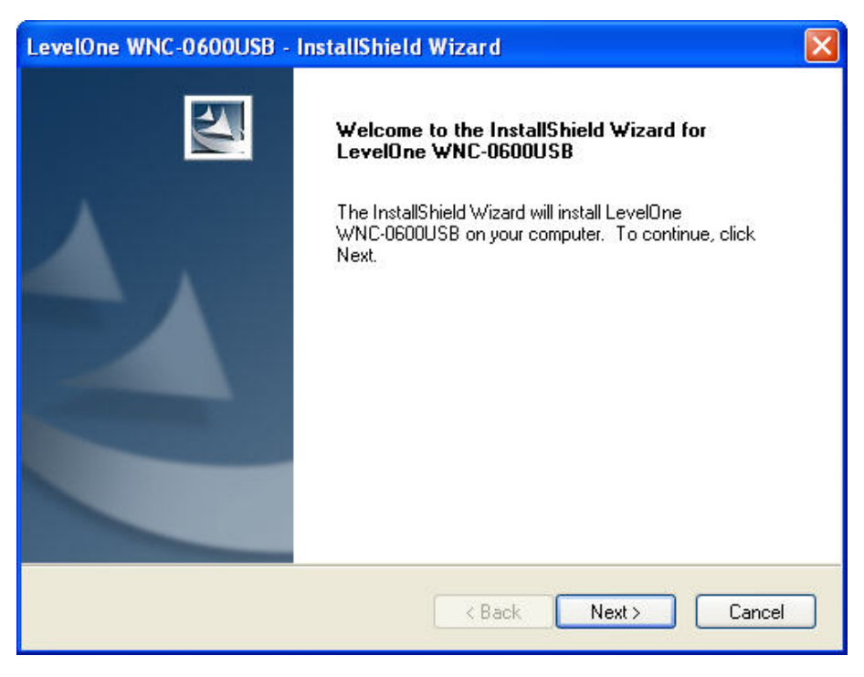
Figure: Start Installation

5. On the screen below, click "Next" to start the installation.