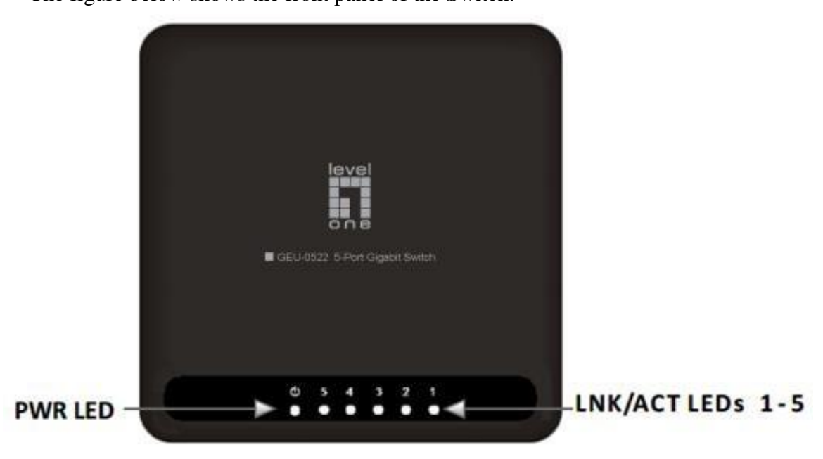
5-port Gigabit Switch Front Panel

1 · Front Panel The figure below shows the front panel of the Switch.