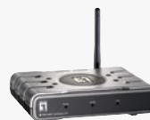
WAP-3000 11g Wireless Access Point