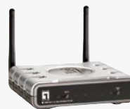
WBR-6011 300Mbps N_Max Wireless Router