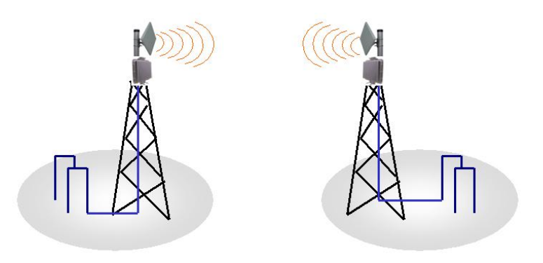
WAN-4230 works with WBA-4000 for Point-to-Point wireless bridging applications