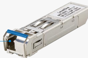
LC Simplex Connector

The SFP-9221 transmits using a wavelength of 1310nm and receives using a wavelength of 1550nm. When coupled with the LevelOne SFP-9231 transceiver which transmits at and receives at the opposite rates (1550nm RX and 1310nm RX) you get bi-direction data communication on a single fiber core.