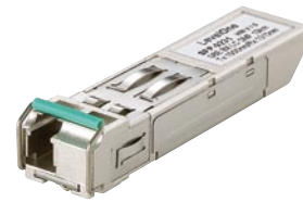
Mini-GBIC BIDI Transceiver 80km