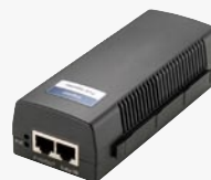
POI-2001 Gigabit Injector