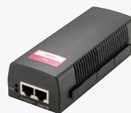
POI-2002 PoE Injector