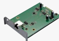
ACC-1000 KVM Cat.5 Console Module