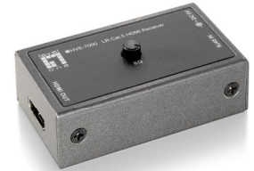
Long Range HDMI Receiver HVE-7000