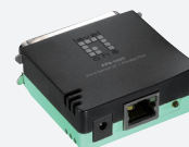
FPS-1031 Print Server with 1 Parallel