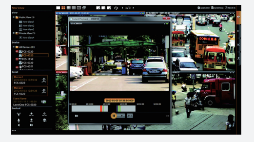
Instant playback in live view window