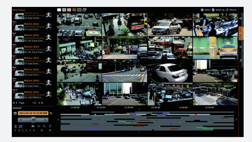
Up to 100 channels synchronized playback