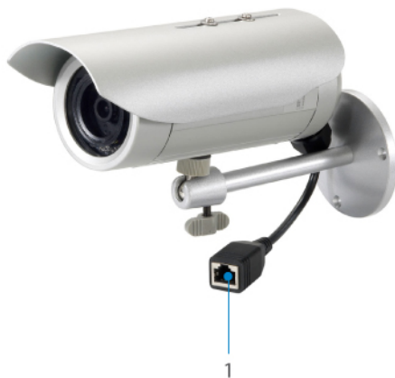
1. Ethernet Port