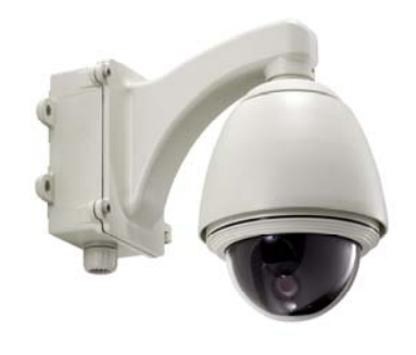
FCS-4000/4100/4200 with CAS-4000A

LevelOne further has available alternative Digital Surveillance Software Packages for professional and advanced use.