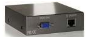
AVE-9200 Cat.5 Audio/Video Receiver

Easy Installation -- With its compact design, our Cat.5 Audio/Video Extender easily fits on a desk or any limited space. No software or interface card is required. You can easily activate this device by simply connecting it to the power source and to the network cable, further saving cable layout and cable installation cost.