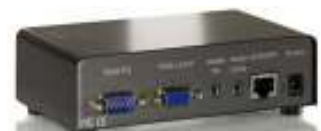
AVE-9201 1-port Cat.5 Audio/Video Broadcaster