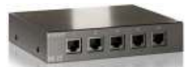
AVE-9205 5-port Cat.5 Audio/Video Broadcaster