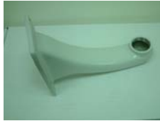
Wall Mount Tube