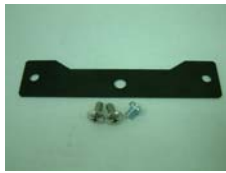
Bracket and Screws