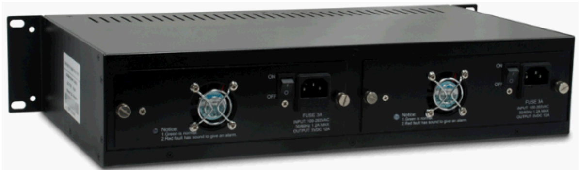
The Rear Panel

The 3-pronged power plug; On/Off switch and ventilation fan are located at the Rear Panel of the Media Converter Chassis. The Chassis will work with AC in the range AC 100~265 VAC, 50/60 HZ.