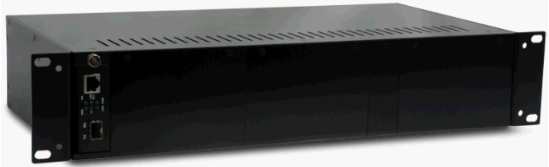
The Media Converter Chassis

The Media Converter Chassis is a modular unit, and its chassis contains 14 slots for optional modular converters. The Physical Dimensions of The Media Converter Chassis are 428mm x 230mm x 90 mm.