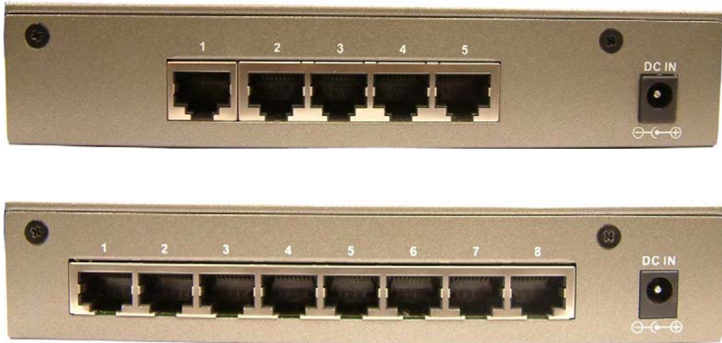
Figure 2-2. The Rear Panel of the 5/8 Port Gigabit Switch