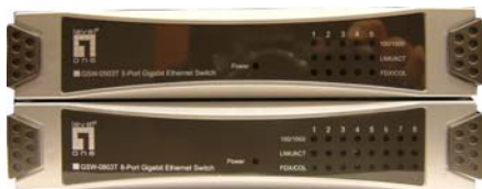
One 5/8-Port Gigabit Switch