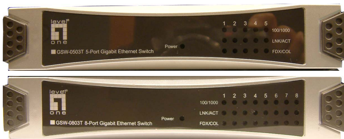
Figure 2-1. The Front Panel of the 5/8-Port Gigabit Switch

The Front Panel of the 5/8-Port Gigabit Switch consists of LED-indicators (100/1000, Link/Activity, Full duplex/Collision) for each Gigabit port and power LED-indicator for unit.