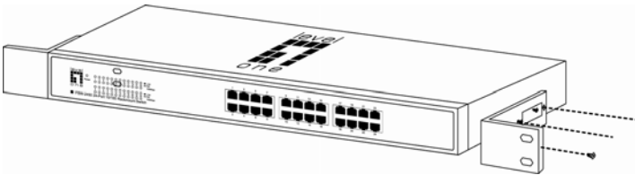
Figure 2-1 Rivet the 'L' brackets onto the Switch

Power off all the equipment connected to the Switch before mounting it in the rack, then rivet the two "L" brackets onto each side of the Switch, and fasten it with screws in the rack.