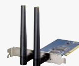
WNC-0601 300Mbps N_Max Wireless PCI Card