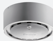
WAP-6102 300Mbps Wireless Ceiling PoE Access Point