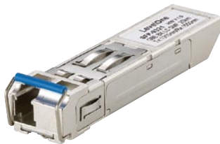
Mini-GBIC BIDI Transceiver 80km