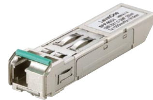
Mini-GBIC BIDI Transceiver 80km