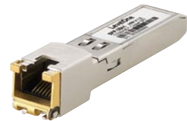
1000 BASE-Tx Copper