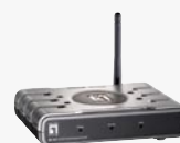
WAP-3100 11g PoE Wireless Access Point