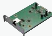
ACC-1000 KVM Cat.5 Console Module