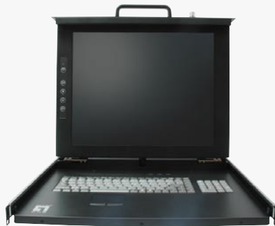
1. KCM Moudule Connector

LevelOne also offers a unique module for remote server control. Just slide in the IP Console Module (ACC-2000) to KCM-0831/1631 to access and manage the server farm over the Internet using a standard web browser. It supports a 1600x1200 pixel screen resolution for high-quality viewing.