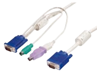
ACC-2101 PS/2 and USB Cable KVM 1.8m