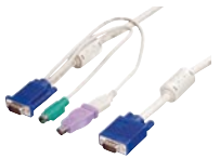
ACC-2103 PS/2 and USB Cable KVM 5.0m