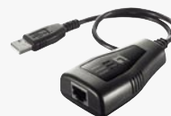
USB-0201 USB Gigabit Ethernet Adapter