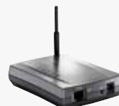
WUS-3200 Wireless 2-Port USB/MFP Server