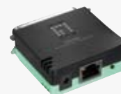
FPS-1031 Print Server with 1 Parallel