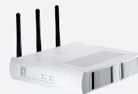
WAP-6012 300Mbps Wireless Gigabit PoE Access Point