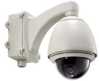
FCS-4000/4100/4200 with CAS-4000A

LevelOne further has available alternative Digital Surveillance Software Packages for professional and advanced use.