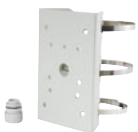
FCS-4010 Pole Mount Kit