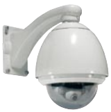
DOH-1000 Domed Outdoor Housing