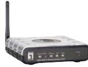
WAP-6002 150Mbps N Wireless Access Point