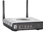
WAP-6011 300Mbps N_Max Wireless Access Point