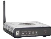
WAP-6002 150Mbps N Wireless Access Point