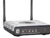
WAP-6011 300Mbps N_Max Wireless Access Point